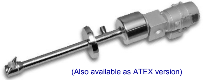
(Also available as ATEX version)