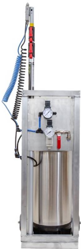
ECO Fog Model 1