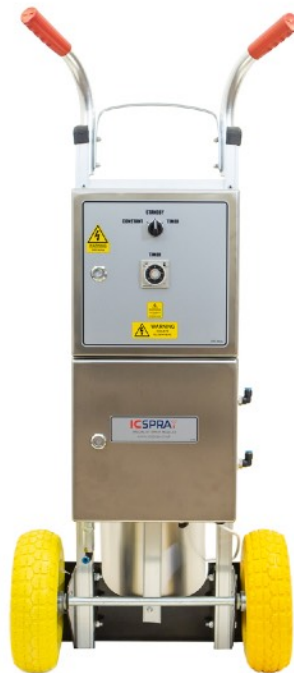
ECO Fog Model 2