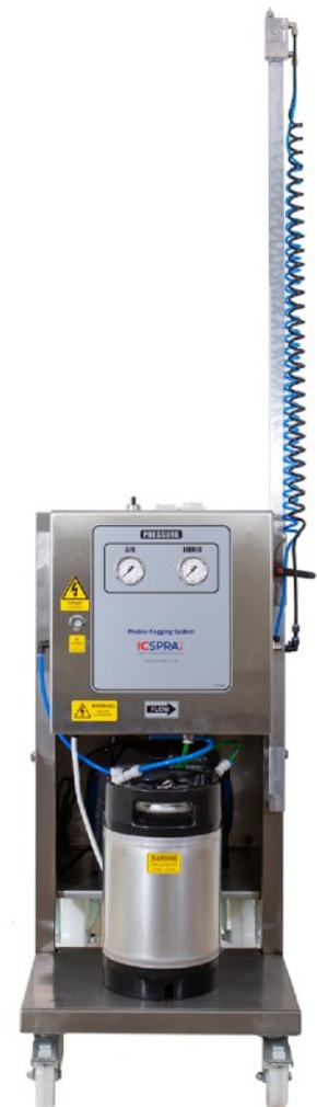
ECO Fog Model 3